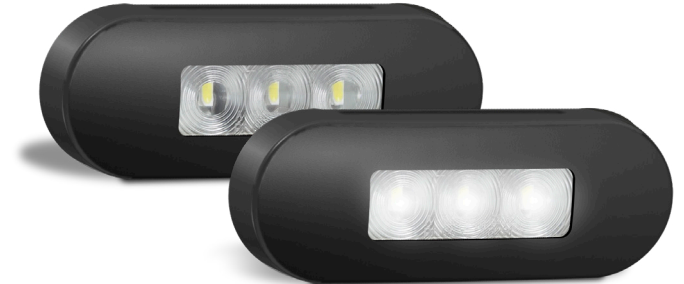
Part Number 86BWM - Blister Single 86BWMB - Single Bulk