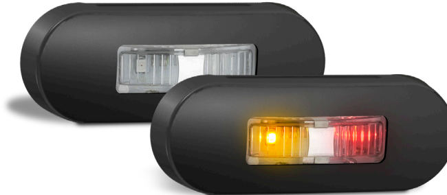
Part Number 86BARM - Blister Single 86BARMB - Single Bulk