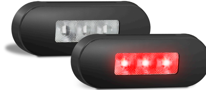
Part Number 86BRM - Blister Single 86BRMB - Single Bulk

Approvals Function Category CRN ADR Rear End 49/00 46821 ADR Side Marker 74/00 46827 ADR Side Marker 45/01 48024 ADR Front End 49/00 46897