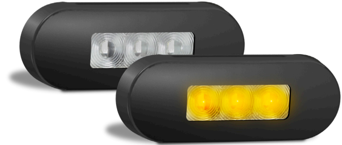
Part Number 86BAM - Blister Single 86BAMB - Single Bulk